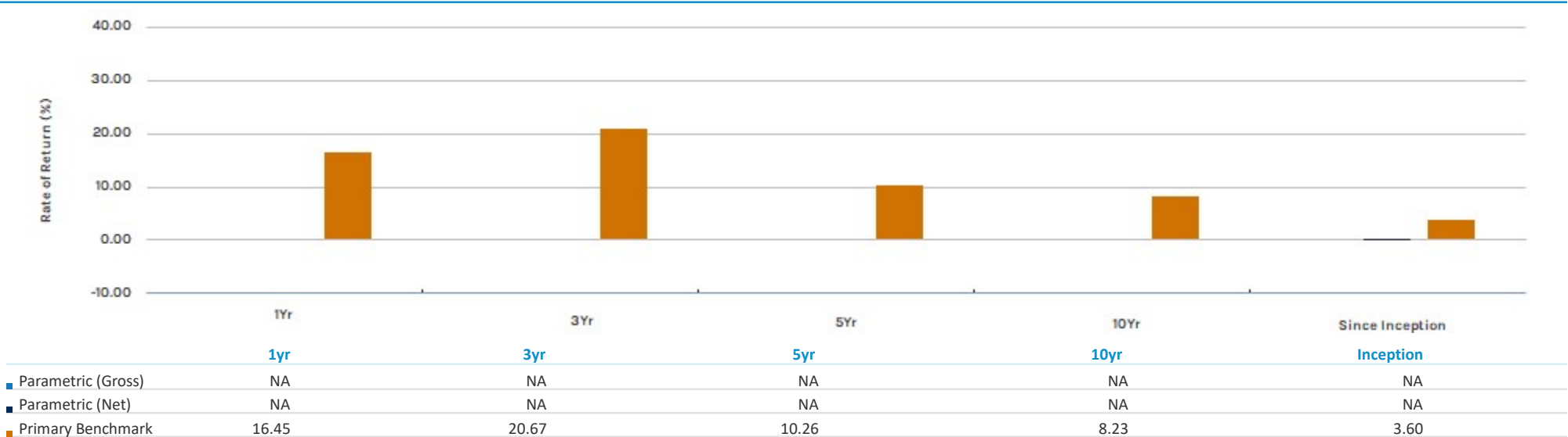
Average Annual Return (%) - Periods Ending 09/30/25

Strategy Inception Date: 10/2024 2 Morgan Stanley Composite Date: -